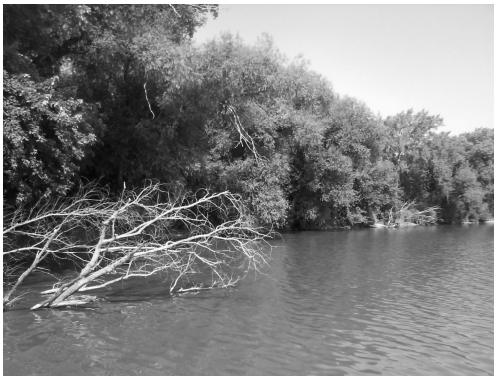
With 3700 feet of natural shoreline on Lake Winnebago, Picnic Point is open to the public for non-motorized and nature based recreation.

Prior to the transfer to the DNR, an Advisory Committee was formed to develop a property management plan in conjunction with the DNR and solicit public comment on the plan. There was general agreement that the property be kept in a natural state for the benefit of wildlife, fish and public enjoyment through nature-based recreation. The Advisory Committee defined the primary purpose of the property "To function as fish and wildlife habitat, to preserve the local archeological sites, and to provide an area for the public to enjoy Lake Winnebago and the surrounding shoreline through non-