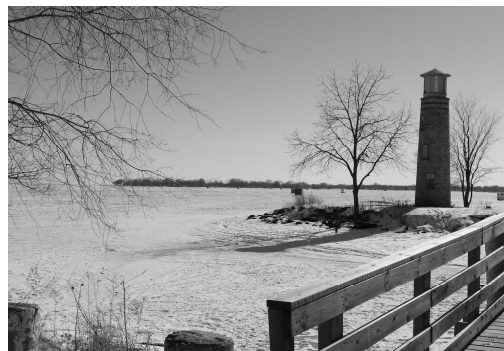
The Draft Management Plan incorporates the 56 acre Asylum County Park adjacent to the property. The lighthouse in Asylum Bay is located nearby.

The community, local scout troops, civic and conservation organizations and school groups can provide invaluable support to accomplish some of the recommended land management practices in the draft plan.