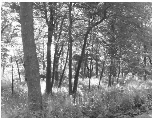
Community conservation and youth groups will be called upon to help remove invasive plants and reseed with oak, hickory and native prairies.